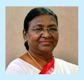
Visitor Her Excellency Smt. Droupadi Murmu The President of India

Established by the Central Universities Act of Parliament (Act No.3C of 2009)