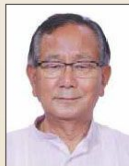
Shri Ranjan Singh Hon'ble Minister of State for Education