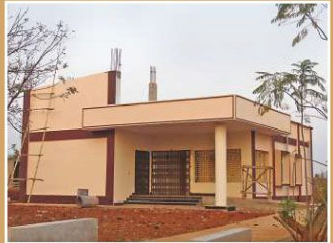
Construction of the Health Centre in CUO permanent campus at Sunabeda is on the verge of completion.