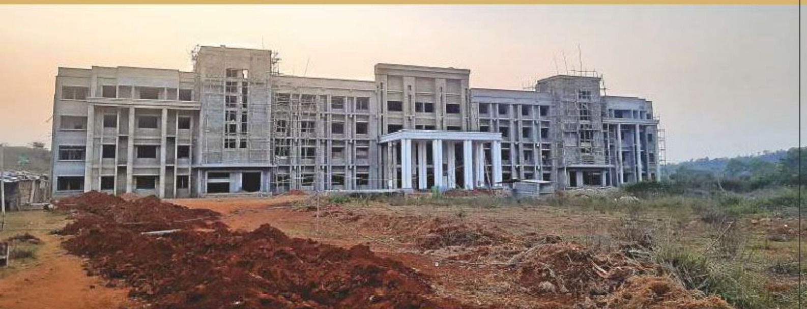
Construction of the First Permanent Academic Block in CUO permanent campus at Sunabeda is on the verge of completion.