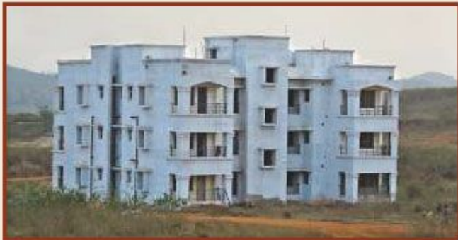
Construction of the Residential Quarters in the CUO permanent campus at Sunabeda is on the verge of completion.