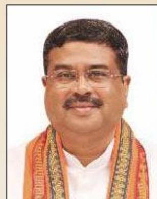
Shri Dharmendra Pradhan Hon'ble Education Minister