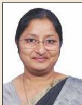
Mrs. Annpurna Devi Hon'ble Minister of State for Education