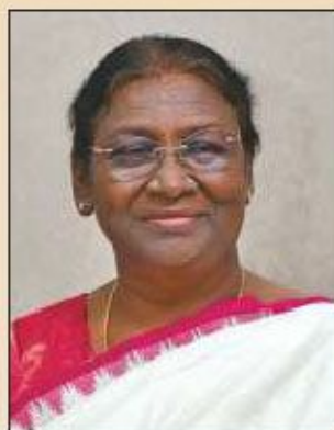
VISITOR Her Excellency Smt. Droupadi Murmu The President of India