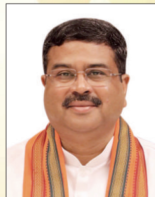
Shri Dharmendra Pradhan Hon'ble Education Minister