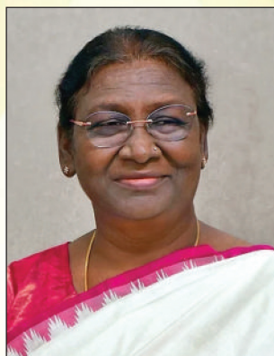
VISITOR Her Excellency Smt. Droupadi Murmu The President of India