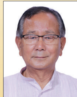
Shri Ranjan Singh Hon'ble Minister of State for Education