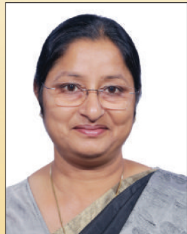
Mrs. Annpurna Devi Hon'ble Minister of State for Education