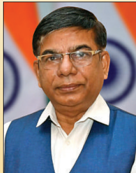
Dr. Subhas Sarkar Hon'ble Minister of State for Education