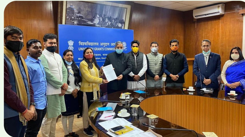
At University Grants Commission (UGC)