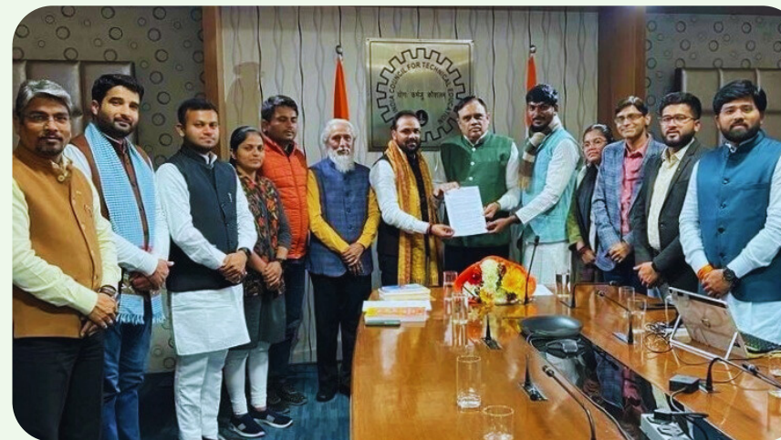
At All India Council for Technical Education (AICTE)