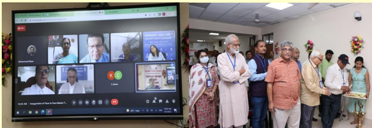
Left : Guests joined online; Right : Dignitaries assemble for lighting the lamp for inauguration