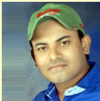
Cover Design and layout Shri Sibaram Patra Section Officer